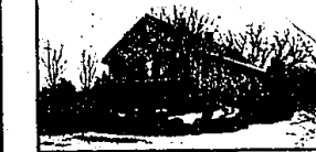
CHARMING OLDER HOME! This beautiful property has four units with one unoccupied. Could be remodeled for a single family residence. Has a lovely lake view. $158,000 (ED-H-90DEL) Call 646-1400