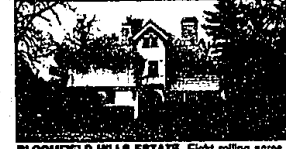
BLOOMFIELD HILLS ESTATE. Eight rolling acres of prime property close to Cranbrook School. Majestic 17 room home overlooks the woods and the Rouge River. 6-7 bedrooms, 5 baths, maid's quarters. $3,000,000 (ED-B-83LOR) 461917 Call 644-6700