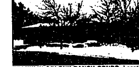
FRANKLIN COLONY RANCH CONDO. Location, seclusion, luxurious and spacious ranch condo with fabulous floor plan. Third bedroom works as library. Center island kitchen. Multi-decks. $199,900 (ED-B-07WAL) 503602 Call 644-6700