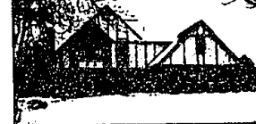
ELEGANT, TROY COLONIAL on beautifully landscaped lot with deck and gazebo. Upstairs bridge overlooks dramatic living room with cathedral ceiling. Dining room has bay window. $274,900 (ED-H-23POP) 501145 Call 646-1400