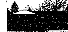
GORGEOUS BRICK RANCH! Family room has gas fireplace. Updates in kitchen and bathrooms. Central air, recessed lights and 2 plus car garage. New cement walkway and brick pavers. Neutral decor and landscaping. $194,500 (ED-H-54MEA) 459785 Call 646-1400