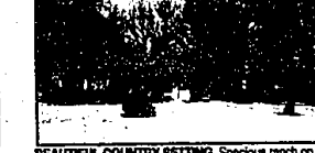
BEAUTIFUL COUNTRY SETTING. Spacious ranch on treed lot. Fireplaces in breakfast room and great room. Three bedrooms and two and one half baths, glassed heated family room and den, first floor laundry and basement! $199,000 (ED-H-25BEL) 406693 Call 646-1400