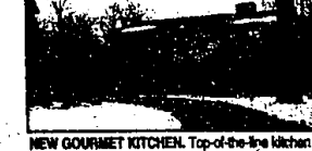
NEW GOURMET KITCHEN. Top-of-the-line kitchen with granite countertops. Totally redecorated in 1995. Spacious rooms and great traffic flow, plus a top Bloomfield Village location. $725,000 (ED-B-50IND) 503673 Call 644-6700