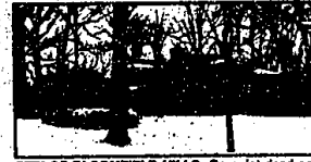
CITY OF BLOOMFIELD HILLS. On quiet dead-end street. First floor master suite plus 2 bedrooms updates with attached baths. Great room with cathedral ceiling of washed pine. Security and sprinkler system. $885,000 (ED-H-95LON) Call 648-1400