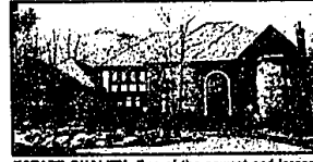
ESTATE QUALITY. One of the newest and largest homes in Chestnut Run N. Custom home with quality lighting, marble, granite, custom wood detail, hardwood floors, two kitchens, 4 car garage, wrap-around deck. $1,095,000 (ED-H-30MEA) 459409 Call 646-1400