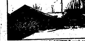
CONTEMPORARY WEST BLOOMFIELD ranch condo offers stunning kitchen, cathedral ceilings, marble fireplace, finished lower level, 3 full baths, extra rooms, patio and deck! $174,900 (ED-W-62DAN) 501365 Call 628-4000