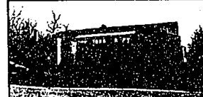
CONTEMPORARY ENTERTAINER'S PARADISE. Be proud to call this custom ranch with full finished walk-out and total rear privacy your castle. It will take an hour to tour with numerous and exciting features. $399,900 (ED-W-27BHO) 455921 Call 628-4000