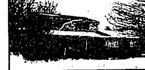
MOVE RIGHT IN! Rochester Hills colonial has 4 bedrooms and is very sharp and inviting. Open kitchen leads to family room with fireplace and doors to patio overlooking large yard. Close to shopping. $182,000 (ED-H-19GUN) 504595 Call 646-1400