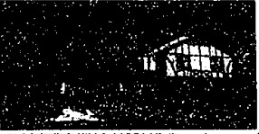
BLOOMFIELD HILLS ACRES. Three plus acres of valley terrain with possibility of a lot split. Five bedroom Tudor home rebuilt in 1980. Large family room with fieldstone fireplace, huge country kitchen. $399,000 (ED-B-67STO) 462695 Call 644-6703