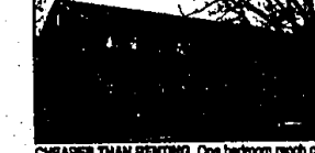
CHEAPER THAN RENTING. One bedroom ranch condo with clubhouse and pool! Association fee $120.00 includes heat and water. Best buy in town! $28,000 (ED-W-36 SH) 501813 Call 628-4000