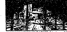
CLARKSTON EXECUTIVE LEASE. 5 bedroom, 3 bath contemporary elegance. Spectacular views, finished lower level. Cathedral ceilings, cowe moldings. Neutral throughout. An outstanding home. (ED-B-50DEE) 457291 Call 628-4000