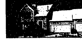
CLARKSTON TOWNHOUSE. Charming and private complex. This unit offers two bedrooms, 2 1/2 baths with attached garage. Walk-out basement also! $134,900 (ED-W-67NEW) Call 628-4000