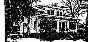
UPPER STRAITS LAKEFRONT Orchard Lake, West Bloomfield Schools. Magnificent lakefront view and sandy beach. Three bedroom cottage or spectacular building site. 92 ft. of lake frontage. $380,000 (ED-W-33SHO) 455270 Call 628-4000