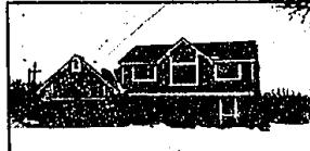
COMMERCE TOWNSHIP. Colonial with spacious floor plan, crown molding, recess lighting, bay window and French doors in office suite. Elaborate master suite with Jacuzzi. Central air. $239,900 (ED-W-40WIN) 504361 Call 628-4000