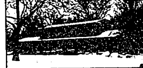
WONDERFUL FAMILY COLONIAL in established Bloomfield Hills subdivision. Numerous major updates. 4 bedrooms, 2 1/2 baths, family room, separate dining room, first floor laundry. Great patio to treed lot. $249,900 (ED-B-29PEB) 454806 Call 644-6700