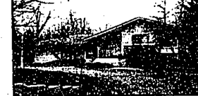
PARKLIKE SETTING. Almost one acre in the heart of Birmingham. 5-6 bedrooms, 4 1/2 baths, custom built in 1977 by Frankel. Huge country kitchen. Gorgeous pool with whirlpool, slide and gazebo. Great family home. $648,000 (ED-B-50ARL) 435670 Call 644-6700