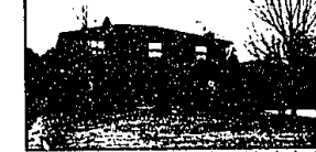
CONSERVE ENERGY with supplemental solar heating in this 4 bedroom home with large kitchen, large first floor laundry, 4 good size bedrooms and 2 full and 2 half baths. Open floor plan. Nicely located in subdivision. $199,000 (ED-B-27MID) 460006 Call 644-6700