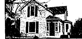
OFFICE LOCATION. Prime visible site five blocks from downtown Rochester. 4 offices, conference room, reception/administration area. Exterior redecorated. New windows. 12 spaces parking near side corner lot. $223,000 (ED-R-02UNB) Call 658-6500