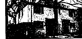
BEST BUY IN BIRMINGHAM. Located across the street from Pembroke Park Bright and sunny, two bedroom, one bath, end unit. Also offers two car garage. $73,500 (ED-H-21ETC) Call 646-1400