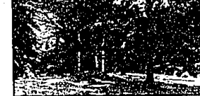
VILLAGE OF FRANKLIN. Colonial on nearly one acre in beautifully maintained condition. Four bedrooms, library, Florida room and greenhouse. Walk to elder mill and downtown. $315,000 (ED-B-50BRA) 430402 Call 628-4000