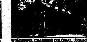
WONDERFUL CHARMING COLONIAL. Updated Open floor plan for entertaining. Spacious rooms. Exposed hardwood floors and cove ceilings. Euro-style kitchen with eating space. Recently finished all season garden room. $205,000 (ED-B-18WOO) 507150 Call 644-6700