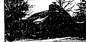
COMMERCE LAKEFRONT. Charming cottage on Commerce Lake with log interior, knotty pine kitchen and fieldstone fireplace. Three bedrooms, 1 1/2 baths and sun room. Many updates. Sandy beach and dock. $146,900 (ED-W-24APP) 503606 Call 628-4000