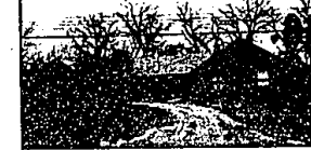
PRESTIGIOUSLY LOCATED RANCH. Up North feeling yet close to expressways. Spacious, gracious and perfect for entertaining. Full walkout lower level. Many rooms overlook natural pond. $209,900 (ED-B-59FOR) 461094 Call 644-6700