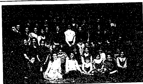
"Oklahoma!": Cast and crew members of Mercy High School's "Oklahoma!" The Farmington Hills school is producing the classic Rodgers and Hammerstein musical as part of Mercy's 50th anniversary year celebration.