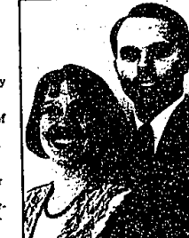
A May wedding is planned in First Presbyterian Church, Farmington Hills.

Her fiancé is a graduate of Nordonia Hills High School and Miami University in Oxford, Ohio, with a bachelor's degree in systems analysis. He is employed by Ashland Chemical in Columbus, Ohio, as a systems engineer.