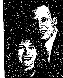
Process Controls Inc. in Farmington Hills as a sales engineer. A May wedding is planned.

Her fiancé is a graduate of North Farmington High School and earned a bachelor of science degree in mechanical engineering from Michigan State University. He is employed by Great Lakes