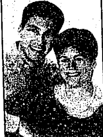
An August wedding is planned in the Shrine Chapel of Our Lady of Orchard Lake.

Her fiancé received a bachelor's degree in political science and also received his doctorate in law from the University of Notre Dame. He is employed by the O'Connor, Cavanagh law firm in Phoenix, Ariz.