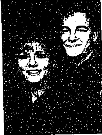
planned in St. Edith Church, Livonia.