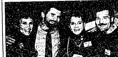
Singles gather: The Meeting Group Party is coming to town March 24 and March 26. For a fee of $15-$18 singles can attend a party hosted by an emcee who helps people get acquainted.