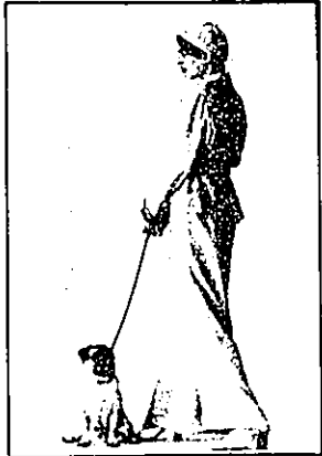
Josie Jacket: The pleated back peplum trimmed with frosted seraph buttons makes this jacket by Zelda elegant, $425. It's paired with a shirt $185, or pant $210. From Scott Gregory in Southfield.