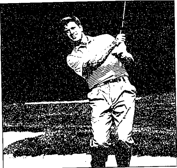
Tee time: Khaki and neutrals in twills and cotton piques from the Bogner Golf collection at Don Thomas Sporthaus in Bloomfield Township, $58-$98.