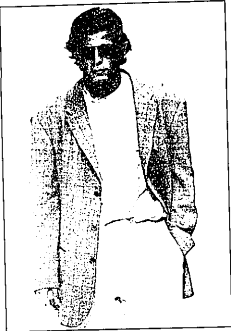
Easy does it: Armani offers this plaid jacket over a banded collared shirt and drawstring pants, an important silhouette for spring at Neiman Marcus, Troy.