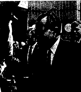
RICHARD NIXON will hit the suburbs.