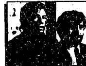
TIMECOP R13 Jean-Claude Van Damme. Time travel action. APRIL 21-29