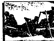
THE RIVER WILD R13 Meryl Streep. Action-packed thriller. APRIL 14-20