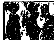
MAVERICK R13 Mel Gibson, Jodie Foster, James Garner. APRIL 4-12