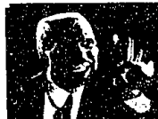
THE MASK R13 Jim Carrey's a toon! APRIL 18-30