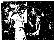
IT COULD HAPPEN TO YOU R13 Bridget Fonda, Nicolas Cage. APRIL 1-18