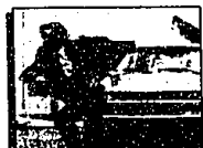
CLEAR AND PRESENT DANGER R13 Harrison Ford wages a one-man war. APRIL 21-30

Dig into our menu of first-time-on-TV movie choices!