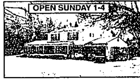
BEAUTIFULLY MAINTAINED COLONIAL in particularly gracious neighborhood. 4 bedrooms, 2 1/2 baths, slate foyer, large open kitchen, family room. $239,900 3711 N. Darlington, S. of Quorton, W. of Lahser (644-6300) 508982