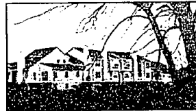
ELEGANT, IMPECCABLE "Baytree" townhouse. Overlooks creek and trees. Premium upgrades. 9' ceilings on 1st floor. Marble fireplace. Loft library. Professionally finished daylight lower level. $183,900. (689-7300) 458008