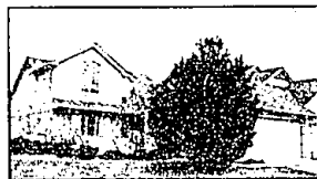
FABULOUS 3 BEDROOM, 3 FULL BATH townhouse in Troy in beautifully landscaped private setting. 3rd bedroom/finished library with glass French doors. Marble fireplace, high ceilings. $199,500 (644-6300) 507741