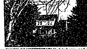
CHARM OF YESTERYEAR! Updated cape cod on trend acre. Fireplace in living room, country style kitchen & sunny library. Sitting room off master bedroom, could be nursery. Much to newer. $164,900 (644-6300) 458832