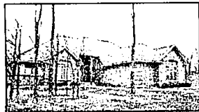
FABULOUS OXFORD ESTATES , 1st floor master suite, 3 bedrooms up, 15' ceiling and fireplace in great room set the pace for this home with custom details. Island kitchen with Sub-Zero, Jenn-Aire. $399,900 (851-5500) 460271