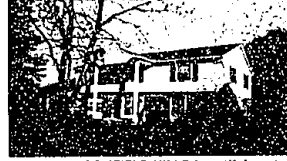
CITY OF BLOOMFIELD HILLS beautiful center entrance colonial. 4 bedrooms, master suite with sauna. Family room fireplace, 1st floor laundry. Many updates and extras. Patio and pool on an acre site. $359,900 (644-6300) 509131