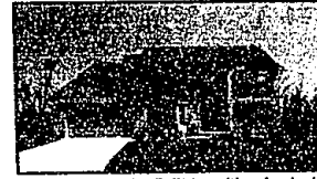
GORGEOUS 1992 - Built transitional colonial backs to woods. Great Farmington neighborhood. Lovely neutral decor. Living room, family room, library and four bedroom! Center island kitchen. (861-6500) 516327