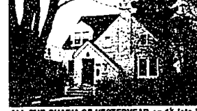
ALL THE CHARM OF YESTERYEAR on 1 1/2 lots in Royal Oak Shrine area. 3 bedrooms, library, hardwood floors, updated kitchen, bath and electrical. Carpeted playroom or family room in basement. $169,900 (644-6300) 507487