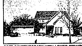
SOFT CONTEMPORARY WITH LOWER STRAITS LAKE privileges. 3 bedrooms. Skylighted living room, family room opens to kitchen, library. Beautiful yard with premium landscaping. $229,900 (644-6300) 508812