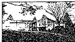
BLOOMFIELD HILLS CONTEMPORARY , soaring beamed ceilings and walls of glass. Kitchen with Gaggenau cooktop and Sub-Zero, 4 bedrooms, 4 1/2 baths, in-law suite and family room. (644-6300) 450653

MAY THIS 45-YEAR OLD BE OF SERVICE TO YOU?