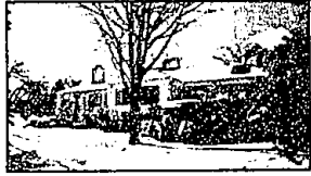
BLOOMFIELD HILLS 3 BEDROOM DREAM HOME . Outstanding workmanship and quality combined with elegant decorating. "State of the art" kitchen, fantastic master suite, library, 2 family rooms. (644-6300) 503657