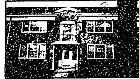
BRING OFFER to this well priced condo in Foxcroft. Bright and cheery. Great location near shopping, banks, athletic club, Bloomfield Schools, pool, clubhouse. Will consider land contract. $85,000. (851-5500) 463061