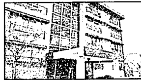
SHORT WALK TO DOWNTOWN BIRMINGHAM from 1st floor 2 bedroom, 2 bath condo. Spacious rooms, formal dining room, step-saver kitchen. Master bedroom with full bath. Covered deck. $120,000 (644-6300) 455171