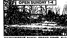
MAGNIFICENT CAHAL FRONT HOME . Enjoy panoramic views from new kitchen, living room. 5 bedrooms, finished walk-out lower level. $259,000. 2860 Chedrick, Wtrd., S. of M-59, W. of Voorhees. (644-6300) 518287