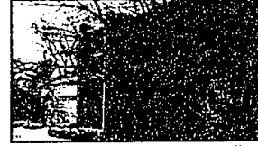
WELL LOCATED AND PRICED . Cranbrook Manor townhouse with many upgrades. 3 bedrooms, 3 1/2 baths, 2-story great room with fireplace, French door to atrium. Rec room and computer room. $175,000 (644-6300) 509135