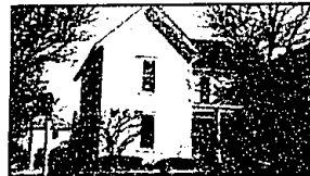
IN-TOWN BIRMINGHAM HISTORIC GEM! Award winning restoration reflecting 19th century charm. 2 bedrooms, 2 baths, custom lighting, living room fireplace, library, gourmet kitchen. $324,900 (644-6300) 506260