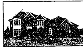
TOUCH OF ELEGANCE in 4 bedroom new home with custom wood detailing, 2 staircases, gourmet kitchen. Other amenities: whirlpool tub, professionally landscaped yard, library with built-ins. Rochester. $308,900 (851-3800) 448256