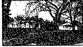
PRIME BLOOMFIELD LOCATION on I-3 acres. Value is in the land. Great investment. Live in now or add onto later. Newer carpet, updated kitchen, walk-out lower level with family room, 2 fireplaces. $215,000 (689-7300) S17154