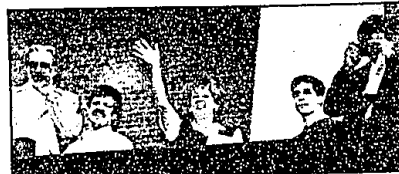
Shout and snap: Family members and friends shout, snap photographs and wave to Harrison graduates as they leave Crisler Arena.