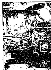
Casper cards: Revisit the friendly ghost's adventures through 120 different trading cards available at Blockbuster.

Even the adult-film, Bridges of Madison County, with Clint Eastwood/Meryl Streep has inspired merchandise. The fragrance "Bridges" has hit the marketplace, priced 18.50 to $35 at J.C. Penney's.