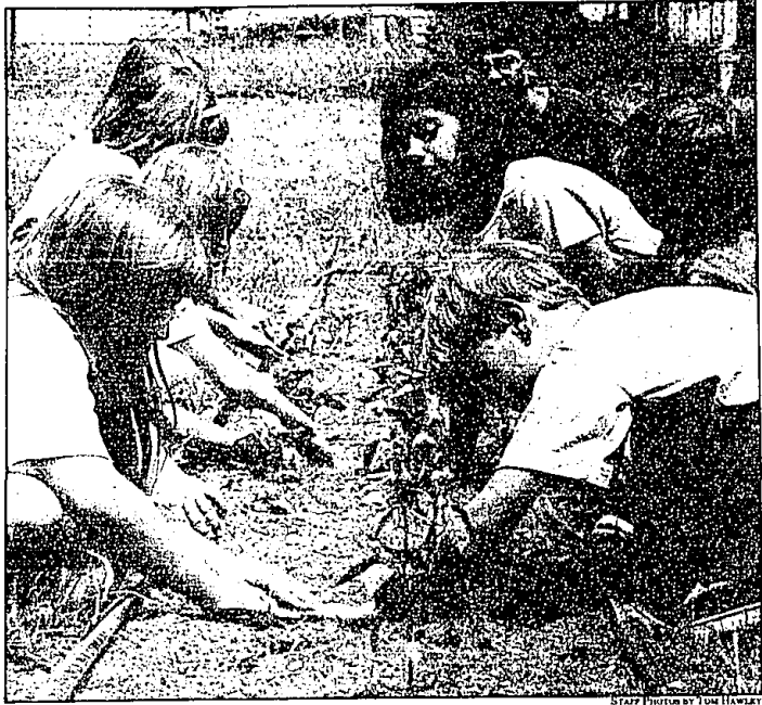
Garden lesson plans: Gill Year-Round graders pull weeds so their beans may grow straight and tall.