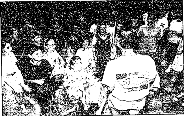
He's a Music Man: Elementary school-age children surround the Music Man during a rehearsal at North Farmington High School.