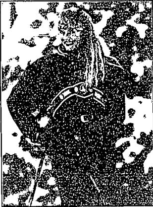
Bogner... For the solo enthusiast or the social skier who wants to make a statement on the slopes. Cold weather enthusiasts will find something practical fun and functional to fit their own personal style.