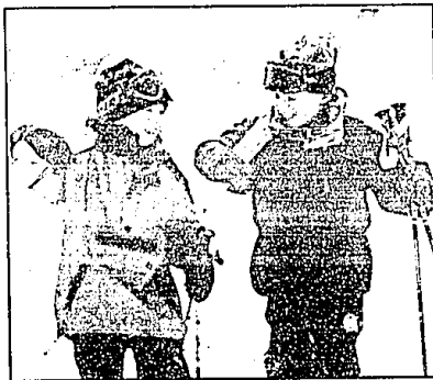
Obermeyer... Skiwear from the heart of the mountains. Obermeyer shares the excitement of skiing and snowboarding with all age groups from toddler to adult.