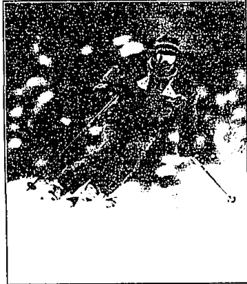
Nordica... Function, fit, and timeless styling for men, women and children. Engineered skiwear to meet the demands of all levels of skiers.