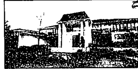
NORTH WABEEK LAKEFRONT Glamorous 11,000 square foot estate. Marble, glass, soaring ceilings, indoor pool. Contemporary dream home. Master suite right out of the movies. $2,500,000 (ED-H-45MOR) Call 644-6700 556261