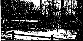
LOWER LONG LAKE AREA. Spacious colonial with spectacular wooded lot. Large rooms with two windows offer magnificent views. First floor master, large family room, den, porch. $724,900 (ED-H-08KIR) Call 646-1400 544887