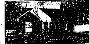
1940 VINTAGE Charming Cape Cod with hardwood floors, 6 panel doors, wet plaster and new furnace. Situated on a double lot. $194,500 (ED-B-76DUN) Call 644-6700 562209