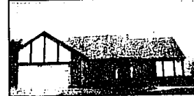
WON'T LAST LONG This 3 bedroom, 2 bath Troy ranch with Great room, country kitchen and full partially finished basement. Central air, vacuum system, large 2 level deck. $199,800 (ED-B-30RIV) Call 644-6700 562618