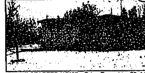
GREAT STARTER HOME - Orion Township. 75x140 lot. Cathedral ceiling in all 3 bedrooms. Updated kitchen and all appliances included. Newer carpet in living room and bedroom. New windows. $74,900 (ED-R-19GAI) 602104 Call 656-6500