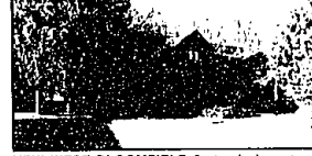
NEW WEST BLOOMFIELD 2 story! elegant, all custom traditional home. Lots of privacy, on cul-de-sac backing to woods. 2 story great room, huge library, kitchen with subzero and finished basement. $314,900 (ED-W-02LAK) Call 626-4000 515143