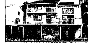
GORGEOUS CASS LAKEFRONT. Outstanding contemporary completely updated. New kitchen, baths, floors & more. Mirrors, marble, cathedral ceilings, fireplace in living room/family room. Perfect for lussu buyers! $429,900 (ED-H-44COT) Call 646-1400 433343