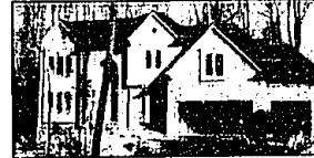
CUSTOM BUILT! Fabulous home with soaring ceilings, an abundance of windows, skylights, gourmet kitchen, spectacular bath, daylight basement, 3 car garage and lots of amenities. $379,900 (ED-W-51HAM) Call 626-4000 542696