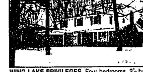
WING LAKE PRIVILEGES. Four bedrooms, 2 1/2 bath colonial New kitchen, carpet, window treatments, hardwood & appliances. Shared private beach with dock & boat storage. Finished lower level. $359,900 (ED-H-61LAK) Call 646-1400 537667