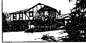
QUALITY GRASSI TUDOR. Lower level walk-out. Updated kitchen adjoining spectacular family room opening to multi-tiered deck. Hardwood floors, crown moldings and bay windows. $485,000 (ED-H-14BRO) Call 646-1400 553873