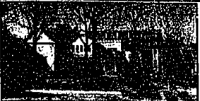
ORCHARD LAKEFRONT ESTATE. Features seven bedrooms, eight full/four half baths. Grand foyer with sweeping staircase to great hall with lowering twenty foot window walls. Lakeside master suite, four car attached garage. $4,500,000 (ED-H-51WES) Call 646-1400 603206