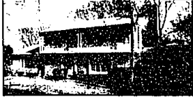
BLOOMFIELD COLONIAL. High on a hill with spacious rooms. Newer kitchen, large living room with fireplace, security system. $632,000 (ED-H-00GLE) Call 646-1400 558119