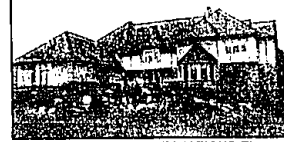
LIVE UP TO YOUR EXPECTATIONS The new kitchen, designed for people who like to cook and entertain at the same time. First floor master suite with fireplace, finished walk-out lower level. $875,000 (ED-B-03CAR) Call 644-6700 535531