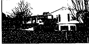
EXCEPTIONAL WALK OUT. Hilltop ranch in Bloomfield Hills. Large rooms, lower level ideal for your guests, your teenagers or your office! Fenced yard for your pets. $495,000 (ED-H-20KEN) Call 646-1400 535738