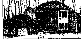
CUSTOM BUILT AND DESIGNED! 2 story ceilings, open floor plan with bridge overlooking great room, library, formal dining room, wood floors, 4 bedrooms, 2 1/2 bath, 3 1/2 car garage. Beach privileges on Bass Lake. $324,900 (ED-W-22HAM) Call 626-4000 600928