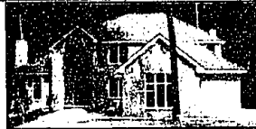
WEST BLOOMFIELD CUSTOM BUILT. Open floor plan, 2 story ceilings, great room, family room, library, gourmet white kitchen with island, and wood floors, 4 bedrooms, 2 1/2 bath, 3 1/2 car garage. $349,900 (ED-W-56ELD) Call 626-4000 534260