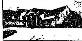
MILFORD CUSTOM CONTEMPORARY! Distinctive custom home overlooking 2 plus rolling wooded acres. Features 5 bedrooms, 2.5 baths, dream master suite, 2 fireplaces, fabulous finished walk-out. $449,900 (ED-W-57HUN) Call 626-4000 602419