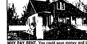
WHY PAY RENT. You could save money and build equity. Wonderfully updated contemporary interior. 2 bedrooms, 2 baths, vaulted ceilings, white kitchen, finished basement, 2 car garage. $112,500 (ED-B-28LIN) Call 644-6700 (503957)