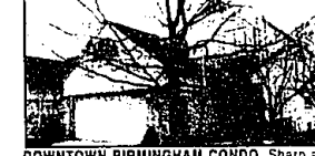
DOWNTOWN BIRMINGHAM CONDO. Sharp and neutral in-town condominium. Only 10 years old! Master suite, loft library, first floor laundry, 2 car attached garage. Private entry. Appliances included. $238,000 (ED-B-80LAN) Call 644-6700 (561995)