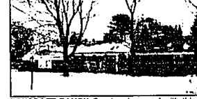
FOX CROFT RANCH Great curb appeal with this 3 bedroom, 2 bath charmer. Very large family room and 3 fireplaces, plus a beautiful lot. $259,000 (ED-B-35POM) Call 644-6700 600797