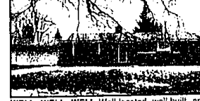
WELL, WELL, WELL Well-located, well-built, and well-maintained. Family room has fireplace and doorwall to deck. Full basement, 3 bedrooms, Birmingham schools. $199,900 (ED-B-20MID) Call 644-6700 601761