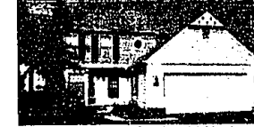
GREAT HEATHERS CONDO. A Highland model with a finished lower level. Two bedrooms, 2 1/2 baths. Neutral decor. Move in today, entertain tomorrow! $228,000 (ED-H-19EDG) Call 648-1400 554270