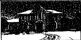
PRIVATE BLOOMFIELD SETTING. Custom Casadei colonial. Stunning two story foyer, all white kitchen, first floor master and laundry. Oak floors, two fireplaces, cul-de-sac setting. $819,000 (ED-H-50BIR) Call 646-1400 601877