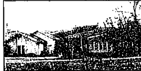
HURON RIVERFRONT. 2.25 acres of wooded property backing to 8th hole of Bogie Lake Golf Course. 4,500 sq. ft. of living space, 5 bedrooms, 3.5 bath, walkout basement with 2nd kitchen, 2 fireplaces and much more $449,900 (ED-W-76COO) Call 626-4000