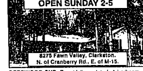
OPEN SUNDAY 2-5 3275 Fawn Valley, Clarkston, N. of Cranberry Rd., E. of M-15.