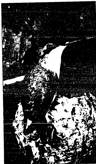
Hummer-hum: To attract hummingbirds, make a fresh solution of nectar from four parts water and one part sugar, then boil.

STORY BY LINDA ANN CHOMIN SPECIAL WRITER