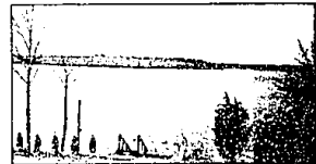
ORCHARD LAKE - 3200 sq. ft. traditional 2 story on acre setting with Orchard Lake frontage with dock and deck at waters edge. Four bedroom, 3 1/2 bath, 2 story LR, FR addition and white St. Charles kitchen with Sub Zero. Spectacular master suite with 6 double closets and private deck. Finished lower level with FP, BR area and full bath. $699,900. Ask for Sandy Norman. 901-0203