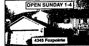
WEST BLOOMFIELD - Spacious townhouse condo with 3 BR and 2 1/2 bath. Kitchen with breakfast area, library. Large MBR suite, finished walkout, 2 car attached garage, pool & tennis cts. $179,900. Ask for Sandy Norman. 901-0203