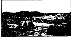
BLOOMFIELD/WABEEK - Fabulous white modular contemporary with dynamic views of the golf course and lake. Over 6000 sq. ft. with 5 BR's and 5 BA's each with a separate bath suite and WIC's. Large entry foyer, marble floors, formal LR, FR and library. High ceilings, decks and an unbelievable finished walkout and 3 car garage. $849,900. Ask for Sandy Norman. 901-0203

Thank You For Making Me The Most Successful Century 21 Agent In Michigan 1989-1996