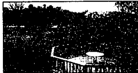
BLOOMFIELD - Fabulous renovated 3500 sq. ft. ranch with an additional 1000 sq. ft. on a completely finished walkout lower level. Located directly on Forest Lake Country Club rear elevation overlooks fabulous views on two of the holes. Three bedrooms, 3 1/2 bath with newer kitchen, GFA, CA, roof and GR addition, MBR suite addition which brings this residence into the 1990's. Loads of ceramic tiled floors, 2 tiers of decking and loads of upgrading. Reduced $30,000 to $519,000. Ask for Sandy Norman. 901-0203