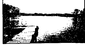
LOWER LONG LAKE, BLOOMFIELD HILLS - Traditional colonial with magnificent fieldstone elevation, and cedar shake roof. Originally built in 1978 by existing owner this residence boasts 4 BR, 4 1/2 BA, FR, paneled library, large island kitchen and 3 FP's. The MBR suite has its own FP, deck, His & Her WICs and large bath suite. There is a finished basement and 3 car garage. Magnificent 1 1/2 acre setting. Reduced over $250,000 to $697,000. Ask for Sandy Norman. 901-0203