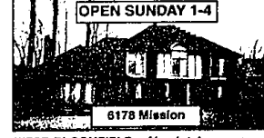
WEST BLOOMFIELD - Absolutely gorgeous traditional model in Mission Springs, 3100 sq. ft., 4 BR, 2 1/2 BA, LR, library and FR with elevated ceiling, huge kitchen, MBR suite with large bath suite and WIC. Shows like a model. Reduced to $304,900. Ask for Sandy Norman. 901-0203