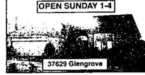
FARMINGTON HILLS. Gorgeous contemporary with first floor MBR suite with 3 vanities, GR with 12' ceiling overlooking commons, pond. Fabulous white formica kitchen, library with 9' ceiling, 3 bedrooms up, fabulous spa in redwood on elevated deck. Shows terrific $289,900. Ask for Sandy Norman. 901-0203