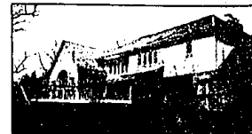
HIDDEN LAKE-BLOOMFIELD/ECHO PARK - 7700 sq. ft. Tudor. Five bedroom, 5 bath, 2 lav., 3 FP, GR, FR, library and the most spectacular MBR suite you could imagine! White Euro kitchen with dual Sub Zero, glass enclosed sun porch leading down to spa area connecting to FR and an unbelievable walkout. 1500 sq. ft. of decking overlooking a beautiful wooded setting and views of Echo Lake in a distance, 4 car garage. $1,299,900. Ask for Sandy Norman. 901-0203