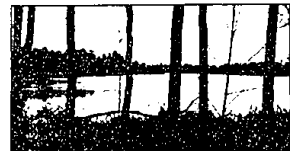
WEST BLOOMFIELD - Fabulous lakefront detached ranch condo in the Woodcliffs. 2500+ sq. ft. on the entry level and an additional 2500 on the finished walkout lower level. Great Room with FP and doorways to deck and water, bleached oak kitchen with island. Library with built-ins, dynamic MBR suite/bath and terrific FR on the lower level walkout. $479,900. Ask for Sandy Norman. 901-0203