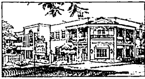
CENTURY 21 TOWN & COUNTRY'S NEW 21,000 SQ. FT. OFFICE IN DOWNTOWN BIRMINGHAM