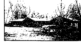
FRANKLIN - 3200 sq. ft. ranch on acre + with 4 BR's, 2 BA's and 2 lavatories, LR with cathedral ceiling, FR with custom built-ins, formal DR. Huge basement, updated GFA, CA, and roof, new on market. $639,900. Ask for Sandy Norman. 901-0203