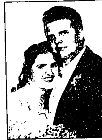
Hawaii and they are making their home in Troy.

A reception was held at the Birmingham Country Club. The newlyweds honeymooned in