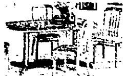
$499. Table and 4 Chairs