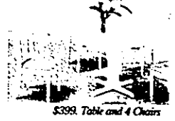
$399. Table and 4 Chairs

LOWER PRICES Save 40% to 70% on all dining furniture.