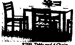
$299. Table and 4 Chairs

We designed a place that will re-define the concept of a "furniture outlet". Sure we have floor samples from our stores, a few customer cancellations and a couple of detested things from our warehouse, but...surprise - you can find new styles, even place custom orders. Wouldn't you know Gorman's would try to do it just a little different, just a little better.