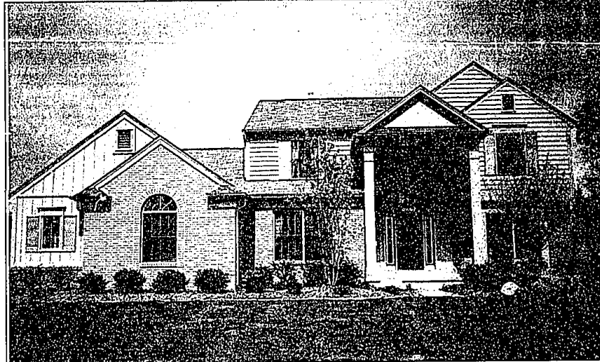
Stonecrest model: This colonial features a library, living room, dining room and family room on the main floor, four bedrooms upstairs.

"They see the quality of things we put in the home and are really amazed at some of the things