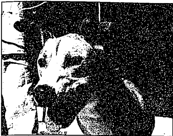
Thor: This 2-year-old male-neutered Shepherd mix is a smart dog and eager to learn. His previous owners never paid him much attention. Because he was alone most of the time and is afraid of other animals, he would do best in a home without pets. Thor (No. R67995) and other pets are available at the Michigan Humane Society Rochester Hills Shelter, 3600 Auburn Road (313)852-7420, noon to 7:30 p.m. Wednesday-Friday and 10 a.m. to 4:30 p.m. Saturday and Sunday.