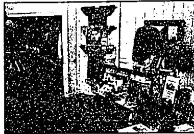
The Secret Closet

The Secret Closet can be reached at (810) 752-2137.