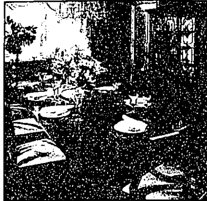
Traditional at Troy, Novi, and Fairlane.

Gorman's Studio of Interior Design in Southfield makes the decorating process even easier. Here, one of the most creative and innovative design teams in the nation can help you make the choice that work, either to fill in a room or to start from scratch. This full-service team can deal with everything from construction details to custom-made furniture.