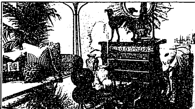
Studio of Interior Design, Gorman's Southfield.

The Gorman's stores are all open 10 a.m. to 6 p.m. except on Sundays, when the hours are noon to 5 p.m. and Mondays and Thursdays, when the stores are open until 9 p.m. The Studio of Interior Design is also open evenings by appointment.