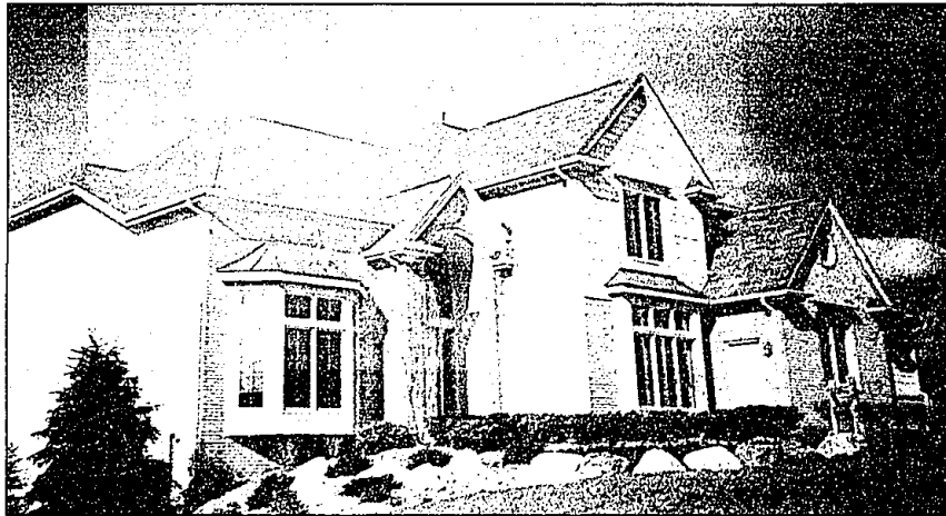
Worthington plan: This colonial, presented by Bing Construction, includes four bedrooms, living room, dining room, family room and study. Curtis-Estate Builders has two models at Vintage Estates.

Curtis-Estate Builders offers seven floor plans ranging from a story-and-a-half of 2,750 square feet with three bedrooms and 2-1/2 baths for $324,900 to a colo-