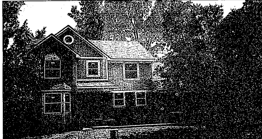
Stoneridge model: This colonial at Campbell Creek features three bedrooms, 2-1/2 baths and nearly 2,000 square feet of living space.

The first floor will feature a library, living room, family room with high ceiling, dining room and a two-way staircase, one set of steps off the main foyer, the