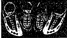
Plains Indian moccasins are among the items featured at the second annual All-American Indian Art Show and Sale 10 a.m. to 6 p.m. at Cowboy Trader Gallery in the upper level of the Merrillwood Building (corner of Merrill and Woodward) Birmingham. Call (810) 643-8833 for information.