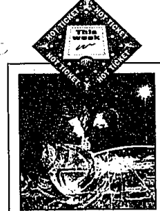
Hot Tire: Recognized as the oldest and largest ice carving festival in North America, the Plymouth Ice Spectacular in Kellogg Park, downtown Plymouth, features ice carving competitions, laser light show, and gingerbread house display. For information call (313) 459-6969.