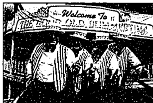
Riverboat cruise: The Delta Steamboat Company's Mississippi Queen keeps alive the steamboating.