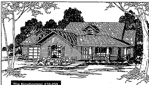
The Binghamton #10-259 Living Area 2000 sq.ft. Outside Dimensions 69' x 52'

For a review plan, including scaled floor plans, elevations, section and artist's conception, send $15 to Associated Designs, 1100 Jacobs Dr., Eugene, Ore. 97402. Please specify the Binghamton #10-259 and include a return address when ordering. A catalog featuring over 170 home plans is available for $12. For more information call (800) 634-0123.