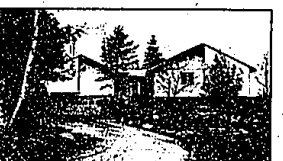
INCREDIBLE WATERFRONT HOME & PROPERTY (1.7) ACRES! Panoramic views of Park Lake. Extensive use of wood & glass, many updates. Beautiful master suite with dressing area, finished walkout lower level. Adjacent waterfront lot also available. $293,000 (644-6300) 700797 ☎ 2452