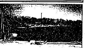
LAKEFRONT ON LOWER LONG LAKE! Spectacular views of Park Lake. Extensive use of wood & glass, many updates. Beautiful master suite with dressing area, finished walkout lower level. Adjacent waterfront lot also available. $849,000 (644-6300) 704912 ☎ 2748