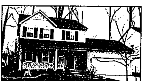
BETTER THAN NEW! Two year old colonial on wooded lot. Many quality upgrades include white kitchen cabinets, custom cherry mantel and french doors to future deck. Full porch across front, beautiful landscaping. $185,000 (644-6300) 706233 ☎ 2824