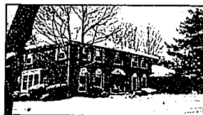
ELEGANT CENTER ENTRANCE COLONIAL on beautifully landscaped lot featuring a lovely private brick paver patio. Gracious foyer with circular stairway. Great family neighborhood within walking to Way Elementary. $449,000 (644-6300) 700803 ☎ 2797