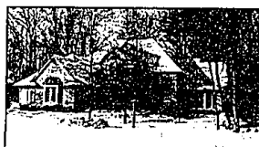
FABULOUS FOUR BEDROOM TUDOR in great Bloomfield neighborhood! Wonderful floor plan, two story foyer, living room with vaulted ceiling, family room and library. Large deck overlooking private treed lot with exceptional landscaping. $589,900 (644-6300) 702069 ☎ 2875