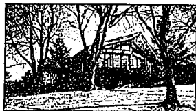
HILLTOP HIDEAWAY ON OVER AN ACRE! Absolute privacy in this extensively renovated brick ranch with lower level walkout. Living room features cathedral ceiling & panoramic views. Master with whirlpool, steam shower & walk in closet. $539,900 (644-6300) 700229 ☎ 2789