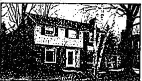
CHARMING BIRMINGHAM COLONIAL! 1993 addition includes dynamic country kitchen, white cabinets, new powder room, vaulted ceiling master bedroom with 2 walk in closets. All new bath, updated half bath. $329,900 (644-6300) 707273 ☎ 2925