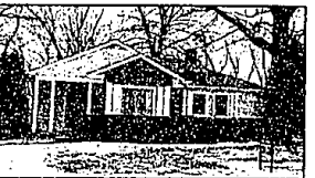
DESIRABLE RANCH IN CITY OF BIRMINGHAM boasts completely updated kitchen. Lower level finished with new bath and extra phone line. Newer windows throughout. Rewired to code with new grounding rod. Two car garage. $159,900 (644-6300) 706715 ☎ 2918