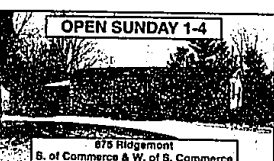
SHARPI SHARPI MOST OF THE WORK IS DONE! Updated kitchen, newer bath with double sinks, furnace, air, shingles, electrical, sprinkler system & water softener. Extra detached garage. Commerce Lake privileges. $124,000 (851-3500) 707259