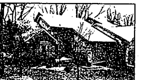
SECLUDED BLOOMFIELD END UNIT CONDO! This two bedroom, 2 1/2 bath townhouse features two story foyer, great room with fireplace, built-ins & bay windows in vaulted library. Bright kitchen with great view. Master designed to pamper. $315,000 (644-6300) 660417 ☎ 2788