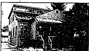
SENSATIONAL, CUSTOM BUILT (1988) IN-TOWN home. Fabulous open floor plan! Quality and detail throughout. Gourmet white kitchen, hardwood floors, huge master suite, bath and 19x14 dressing area. Stereo system. $599,000 (644-6300) 707280