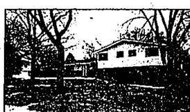
ROBERTSON BUILT QUAD LEVEL features finest craftsmanship & quality. Meticulously maintained 4-5 bedroom, 3 bath home. Unlimited updates include kitchen carpet, landscaping, brick walk & more! $339,900 (644-6300) 707275 ☎ 2924