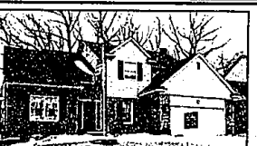
LOOKING FOR NEW CONSTRUCTION! Many upgrades in this beautiful Rochester Hills colonial. Wood flooring in foyer, powder room & kitchen. White, center island kitchen, 9' ceilings & two story foyer. Huge master bath and soaking tub. Cedar deck. $249,900 (551-3500) RH705512