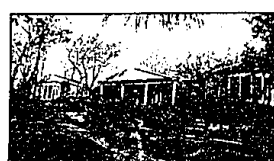
VERY SECLUDED AND ELEGANT RANCH on an extremely private court in City of Bloomfield Hills. Spacious and truly exquisitely decorated. Featured in Detroit Monthly Magazine. Spa room and pool. The epitome of elegance! $1,490,000 (644-6300) 653890 ☎ 2745