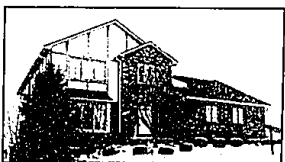
HANDSOME ROCHESTER HILLS TUDOR! This 3 bedroom, 2 1/2 bath home comes with ceramic foyer, large kitchen/breakfast area, master with cove ceiling, and garage with cabinets, workbench, & dropdown ladder for above storage. Must see! $219,900 (851-3500) RH701879