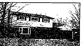
MUST SEE! ABSOLUTELY BEAUTIFUL! This 4 bedroom, 2 1/2 bath colonial offers many updates including furnace, air, roof, gutters, master & hall baths. Hardwood floors in living and dining rooms. Newer carpet in some rooms. $204,900 (851-3500) 711147