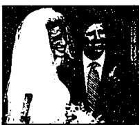
A reception was held at the Country Club of Detroit in Grosse Pointe. The newlyweds honeymooned in the Napa Valley and San Francisco, Calif., and they are making their home in Chicago, Ill.