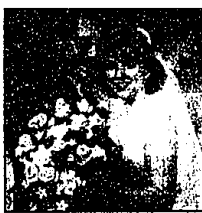
West Bloomfield. The newlyweds honeymooned in New Zealand, and they are making their home in Grand Blanc.

A reception was held at Shenandoah Country Club in