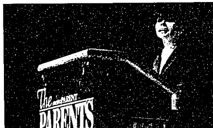
Author speaks: Heidi Murkoff tells the audience about the worries she experienced during her first pregnancy, before she wrote the book on "What to Expect."

It's important: At the podium, Murkoff reminds moms, "Your most significant relationship in your life is your spouse. Nurture your baby but nurture your spouse as well." Murkoff says she and her husband share a leisurely dinner for two after they have joined the kids' mealtime.