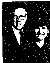
A March wedding is planned at Christ Church Cranbrook.

Her fiancé is a graduate of Lake Forest College and Boston University. He is divisional vice president and controller at Kmart Corp.