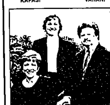
ST. CLAIR TRIO