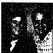
A May wedding is planned at St. Mary's of Orchard Lake.