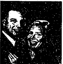
The wedding is planned for May 10 in Cincinnati.