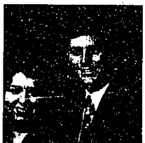
Farmington Hills Baptist Church.