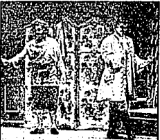
Michigan Opera Theatre's production of "The Marriage of Figaro," opens tonight at the Detroit Opera House, 1526 Broadway, Detroit, (313) 874-SING! (810) 646-6666.