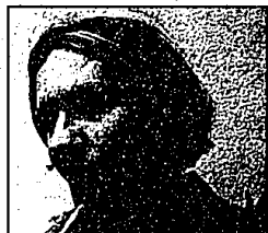
Visiting this summer: Multi-act shows are the rage again this summer. Beck headlines radio station CIMX-FM's "89X Birthday Bash" (88.7) with Pavement, Soul Coupling, Sloan and Dr. Octagon, Wednesday, May 28, at the Phoenix Plaza in Pontiac.

Finis Berea Information for the Top of the Park concert and film series were not available at press time.