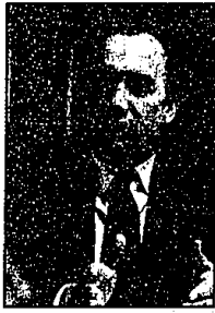
Gov. John Engler