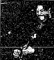
Luther Allison performs at Majestic, 4140 Woodward Ave., Detroit. Doors open 8 p.m. Tickets $12.50 in advance for the 18 and older show, (313) 833-9700.