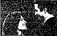
Andy Garcia and Lena Olin star as opposing attorneys whose personal involvement threatens a highly charged criminal case in "Night Falls on Manhattan" opening tonight at metro Detroit movie theaters.