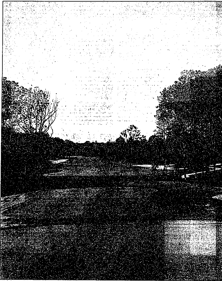
Too it up: Golf is a big attraction to buyers at Prestwick Village. But membership in the golf club is optional.

For more information, call (248) 889-1433.