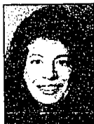
By Anne Fracassa Avanti NewsFeatures

I usually make it a habit to not look at the sticker price of a vehicle I'm testing until the week is over and I'm sitting down to write about it. It used to make me biased and more critical of the vehicle.