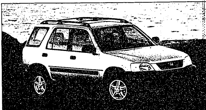
The Honda CR-V...what you see is what you get. And it's all there.

This is the first time Honda has engineered and designed a sport utility on its own. Well done, this CR-V is. It's got styling, sportiness, a rugged look, and even though it looks really small, it really isn't.