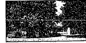
TROY 1.33 ACRES in heart of Troy. Value is in the land which is splittable into two (2) lots. Repair, Rebuild. $179,900 (C416D) 641-1660