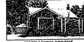
TREE LINED STREET NORTH Royal Oak. Brick Ranch with all appliances. Ready to move into. Full basement 1.5 car detached garage. $139,900 (C37D) 641-1660