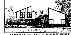
MIDDLE STRAITS PRIVILEGES UPDATED contemporary home on beautiful 1.9 acre tree lot in West Bloomfield. Huge family room with fireplace, deck off kitchen, skylites, newer carpet. $219,000 (W310E) 851-4400