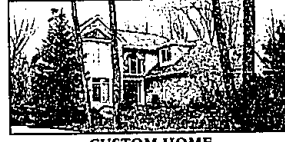
CUSTOM HOME GREAT cul-de-sac location in West Bloomfield backing to trees. Quality appointments. 2-story foyer, vaulted great room. Finished walk-out with 2nd kitchen. $364,900 (C216E) 851-4400