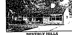
BEVERLY HILLS MOVE in condition. Three bedrooms, 2 full baths. Updated, nice backyard. Two car garage, family room. $134,900 (K136E) 647-6400