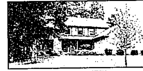
ALMOST NEW JUST built in 1992. Spacious 3 bedroom home on large lot in Commerce backing to open space. Living room and family room, cathedral ceilings. Immediate possession. $229,900 (S140E) 851-4400