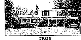
TROY SPACIOUS four bedroom, 2 1/2 bath colonial with large family room and wonderful screened porch. Lovely tree lot and Birmingham schools. $243,900 (C234E) 647-6400