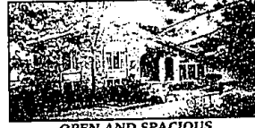
OPEN AND SPACIOUS NICE 5 bedroom Quad-Level on beautifully landscaped lot in West Bloomfield. High ceilings, marble and mirrors. 3 1/2 baths, private deck and patio. Backs to common. $309,900 (R466E) 851-4400