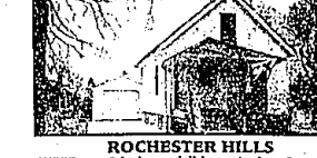
ROCHESTER HILLS SUPER cute 2 bedroom doll house is clean & ready to move in. Many updates include kitchen, windows, carpet, roof, siding, driveway, furnace, more. Deck & fenced yard. $99,500 (M319E) 641-1660

CHAMBERLAIN REALTORS® 2750 W. BIRMINGHAM BLVD. SUITE 100 BIRMINGHAM, AL 35202 (205) 832-2000