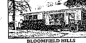
BLOOMFIELD HILLS THREE bedroom brick ranch. Bloomfield schools. Cove ceiling and hardwood floors. Full basement, fenced yard. All appliances includes new washer & dryer. Low taxes. $109,000 (A141E) 647-6400