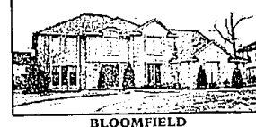
BLOOMFIELD IMMACULATE. Gorgeous large tudor in Bloomfield great entertaining. Elegant, contemporary flat, open floor plan, neutral decor. Library, family room, fireplace. 3 car garage. $360,900 (S176E) 647-6400