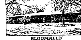
BLOOMFIELD BRICK ranch on large private lot offers 3 bedroom, 2 full baths, neutral decor, full basement. 2 car attached garage and Birmingham schools. $209,999 (W320E) 647-6400