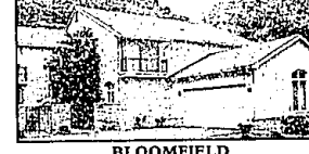
BLOOMFIELD RARE Manorwood model. Four bedroom townhouse. 1st floor laundry, huge deck off living room. Walk out lower level. $269,900 (W140E) 647-6400