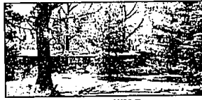
BLOOMFIELD GORGEIOUS inside & out. 3 bedroom ranch w/extensive remodeling outstandingly done. 3 fireplaces, skylights, 6 more. Nearly 1.5 acres of private, beautiful property. $379,000 (L900) 647-6400