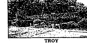
TROY ENJOY viewing this charming three bedroom, 2 full bath ranch home with family room and fireplace located on a very private lot. Birmingham schools. $149,000 (A312E) 647-6400