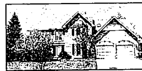
MOVE-IN CONDITION TRADITIONAL 4 bedroom home in Farmington Hills. Open flowing floor plan, hardwood floors, Kohler fixtures, gorgeous master bedroom suite. All quality! $359,900 (N297E) 851-4400