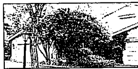
WEST BLOOMFIELD FABULOUS end unit. Beautifully maintained. Lots of extras. Huge first floor master bedroom. Walk-out lower level. The best location. $380,000 (C216E) 647-6400