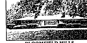
BLOOMFIELD HILLS BEAUTIFUL S. Bloomfield Hills. Spacious 4 bedroom, brick ranch. Bloomfield Schools. Hardwood floors. Well maintained and immaculate. Exceptional lot. $174,500 (L229E) 647-6400