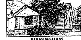
BIRMINGHAM YOU must see this totally updated home with neutral decor throughout. Two bedrooms, basement, 2 car garage and lovely deck. $137,000 (S687E) 647-6400