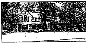
TROY GORGEIOUS tree setting in Beach Forest. Open floor plan, huge great room, oversized library, sunroom opening to decks and yard. $519,900 (O247E) 641-1660