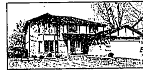
TROY STUNNING brick colonial in popular Athens Meadows. Large bedrooms, plenty of storage, 1st floor laundry, neutral decor. Freshly painted. Lots of extras. $263,900 (S403E) 647-6400