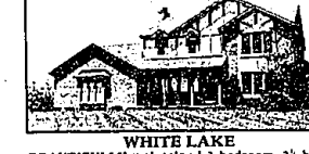
WHITE LAKE BEAUTIFULLY maintained 3 bedroom, 2 1/2 bath Tudor. 3 car garage, screened porch, terraced backyard, sprinklers. Hardwood foyer. Kitchen & family room. Walked Lake Schools. $193,000 (S689E) 641-1660