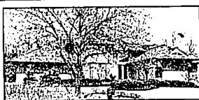
BLOOMFIELD TRANSITIONAL contemporary with all amenities. Magnificent grounds, every bedroom has its own bath. Private gated community. Wonderful light kitchen. $1,290,000 (C125E) 647-6400

Visit Us On Our Web Site http://www.chamberlainrealtors.com