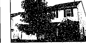
DESIRABLE 4 BEDROOM, 2 1/2 bath Colonial only 5 years old. Features huge master suite w/cathedral ceiling, bath & loads of closet space, 2 story ceiling in family room w/fireplace & bridge overlooking from 2nd floor. This home backs up to protected nature area. $149,900 (ED-W-01BUC) 733032 Call 626-4000