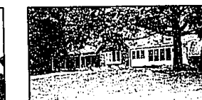
GORGEOUS WILLIAMSBURG CAPE COD. Located on 2.18 acres with spectacular views. This home offers a wonderful large kitchen, 1st floor master bedroom w/walk-in closet, 4 fireplaces, hardwood and teak floors, and screened porch. Impressive living room, dining room with moldings. $525,000 (AR-R-01WAS) Call 656-4500