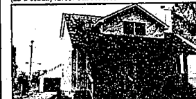
NEWLY CONSTRUCTED IN BEVERLY HILLS. 97 Arts and Crafts Retro. Three bedroom, two bath. White Schrock kitchen. Andersen windows expand space and view. Living room fireplace and first floor bedroom/study. $227,900 (ED-B-68KH) 731668 Call 644-6700