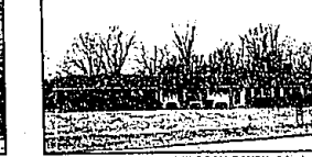
BLOOMFIELD - GREAT 3 BEDROOM RANCH. 3 bedrooms, 2 1/2 baths, family room, new kitchen - all appliances included, all new paint, carpet, blinds, and doors. Large lot. $259,000 (EC-H-703HA) 725182 Call 646-1400