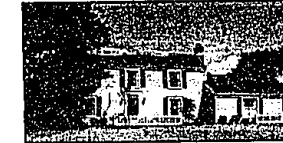
BLOOMFIELD HILLS - WALKOUT RANCH. Wonderful brick and fieldstone home with 4 bedrooms, 3 baths, family room, 2 fireplaces, private yard, Birmingham schools, walkout lower level. $389,900 (EC-H-708RA) 740623 Call 646-1400