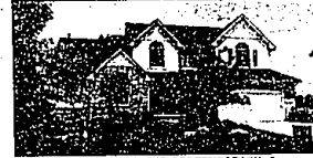
SUNFLOODED, HI-CEILINGED CONTEMPORARY. Gorgeous 5 bedroom home on premium lot on golf course with finished walkout. First floor master suite with steam shower and whirlpool tub. Beautiful white kitchen with bay window and two skylights. $374,900 (ED-B-63GOL) 734544 Call 644-6700