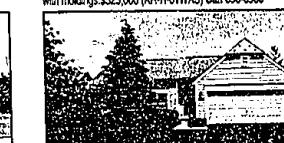
HEATHERS CONDO. Don't miss this 2 bedroom ranch unit with views of the lake. Immaculate, move-in condition. Great for entertaining. Charming condo with neutral decor, security system, fireplace in living room. $310,000 734426 (ED-H-59THI) Call 646-1400