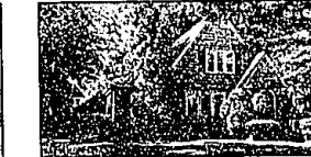
ONE OF A KIND COTTAGE in Birmingham's Poppleton Park area. Much charm throughout well maintained home. Newer two car garage. Three bedrooms, 1 1/2 baths. $324,000 (ED-B-48MAD) 741251 Call 644-6700