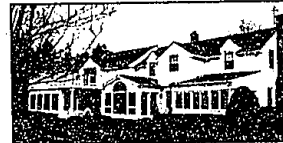
WEST BLOOMFIELD - 100 FT. OF WATERFRONT. Charming 1930's colonial with sunset views and sandy beach. 3 bedrooms, 3 baths, updated gourmet kitchen, 2 Florida rooms, private dead-end street. $659,000 (EC-H-80WEL) 706119 Call 646-1400