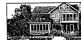
COMMERCE LAKEFRONT! Custom built in 1994. Contemporary floor plan w/a traditional flair, 4,900 sq. ft. of luxury includes: Spectacular kitchen w/Sub Zero, pantry, island, hardwood floors & breakfast room. Spectacular master suite, library, 4 bedrooms, 2 fireplaces and more. $620,000 (ED-W-64CIR) 644043 Call 626-4000