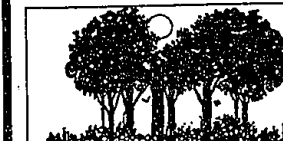
VACANT LAND Call 644-6700 4710 Ardmore, BH, N. of Lone Pine, W. of Latsner $295,000 Quarton Rd., BH, N. of Quarton, E. of Latsner $499,000 4454 Quarton Rd., BH, N. of Quarton, W. of Franklin $285,000 St. Andrew Dr., Indep., N. of Waldon, E. of Sashabaw $124,900