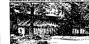
ELIZABETH LAKE PRIVILEGES! Fabulous California Contemporary home! Completely remodeled in '95. 3,044 sq. ft. open floor plan, 2 story ceilings, kitchen w/island, unbelievable master suite, w/screened-in porch overlooking wooded yard, Jacuzzi-sauna & dressing area. $274,900 (ED-W-44FLE) 739533 Call 626-4000