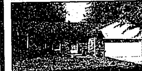
BETTER THAN NEW describes this adorable home. Totally restore affordable ranch with Bloomfield Hills schools. Three bedrooms, 1 1/2 baths. Family room with fireplace. Large living room. Two car attached garage. $170,500 (ED-B-16SON) 722813 Call 644-6700