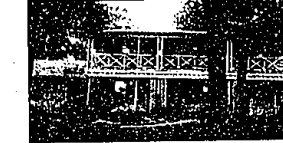
CHARMING LAKEFRONT RESIDENCE. Blending with character & tradition, this spacious home on all-sports Tull Lake fulfills all your dreams. 4 bedrooms, 4 baths, formal dining & living rooms, 2 fireplaces, hardwood floors, lower level walkout plus the joy of lakefront living. $349,000 Call 625-9300