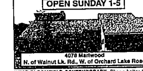
OPEN SUNDAY 1-5 4078 Meritwood N. of Walnut Lk. Rd., W. of Orchard Lake Road WEST BLOOMFIELD CONTEMPORARY. Shows better than a model. 4 bedroom, 4 1/2 baths, master suite you've dreamed of. Lower level with media center, wet bar and exercise room. This home boasts cathedral ceilings, recessed lighting & spacious floor plan. $399,000 (ED-W-78MAR) Call 626-4000