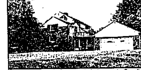
POSTCARD SETTING. Great opportunity to renovate. Open living room with vaulted ceiling. First floor bedroom. Plans by noted architect are available or use your own imagination. $375,000 (ED-B-90HOR) 655439 Call 644-6700