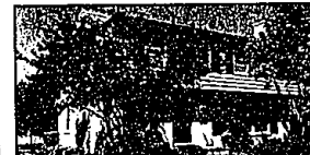
WONDERFUL WEST BEVERLY COLONIAL. New white kitchen, new carpet, newly refinished hardwood floors throughout. New window treatments, never fumaced, and garage door. Freshly painted inside and outside. Three bedrooms, 1.5.5 baths. $279,900 (ED-B-83BED) 727561 Call 644-6700