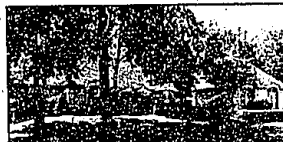
BLOOMFIELD HILLS-CLASSIC COUNTRY FRENCH. 4 bedrooms, 3 1/2 baths, premium lot, brick covers, well done finished lower level, 1st floor master, professionally decorated & landscaped. Popular Chestnut Run South. $775,000 (EC-H-35STO) 740800 Call 646-1400