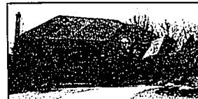
BLOOMFIELD HILLS - ARCHITECTURAL DIGEST LOOK-A-LIKE. 5 bedrooms, 4 1/2 baths, 3 fireplaces, 2 story family room, newly finished lower level, designer white kitchen, dual staircases. $969,000 (EC-H-64HER) 722325 Call 646-1400