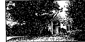
ORCHARD LAKE - SPACIOUS CONTEMPORARY. 6 bedrooms, 3 full baths, 2 hall baths, great room with fireplace, beautiful views. In great yard, exquisite library, walkout lower level, white kitchen. $439,900 (EC-H-09CHE) 739776 Call 646-1400