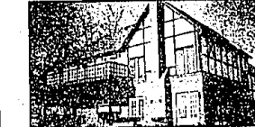
SIX ACRE LAKEFRONT ESTATE. Private English Tudor country home with 5 bedrooms, 5 full & 2 half baths, hardwood floors, a great room showcasing Clerestory windows, master suite with fireplace and magnificent grounds with perennial gardens. $499,000 Call 625-9300