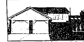
JUST REDUCED! ALMOST NEW. Quality construction through 2500 sq. ft., 2 story Contemporary home. Great room w/fireplace, 3 downfalls, family room and 1st floor laundry. Large bedrooms, finished basement, full bath, central air, security system. $269,900 (ED-W-28TIM) 710043 Ask for Rebecca Call 626-4000