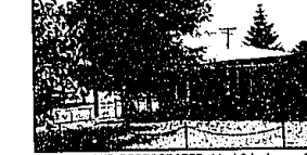
UPDATED AND REDECORATED. Ideal 3 bedroom, 1 bath, basement and 2 car garage. Extensive improvements since 1989, lovely location near school, park and shopping. $95,000 (ED-W-56LUC) 737100 Call 626-4000