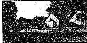
CITY OF BLOOMFIELD HILLS. Outstanding ranch on 1.6 hilly acres with panoramic views. Florida room with six skylights. Master bedroom with 3 bay windows. Four bedrooms, 4.3 baths. Heated 3 car garage. $1,595,000 (ED-B-67WOO) 656302 Call 644-6700