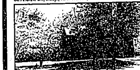
SPACIOUS AND UPDATED. Three bedrooms, three fabulous baths. Great lower level family room with fireplace and large office. Overlooks 1/2 acre lot with pool and lot of decking plus expanse of Andersen windows. Near Lake Oakland. $159,900 (ED-B-75PEL) 740772 Call 644-6700