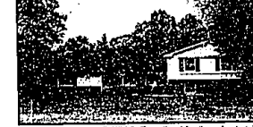
CITY OF BLOOMFIELD HILLS. Exceptional family and entertaining home. Five bedrooms, 2 fireplaces, one in master bedroom. In ground pool - patio walkout. $319,900 (ED-B-67KH) 735076 Call 644-6700