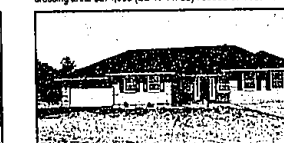
TRANSFERRER PERFECT. Only 20 minutes from the Chrysler Tech Center. One acre hilltop setting. Exciting custom built new construction with many quality upgrades. Waiting for your finished touch! $229,900 (AR-R-93ALE) 730216 Call 658-6500