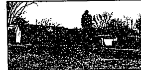
BLOOMFIELD-STEP-UP-RANCH on quiet cul-de-sac. 4 large bedrooms, 2 1/2 baths, marble & ceramic tile floors, updated kitchen. Master bedroom with fireplace, 3 closets & down to refurbished pool. Finished lower level. $459,000 (EC-H-11SHE) 720284 Call 646-1400