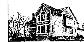
NEW HOME ON COMMERCE LAKE - Waterfront community, direct access to sandy beach, boat docking facilities. Fabulous views! Master suite with walk-in closet, Jacuzzi, private shower. $349,000 (EC-H-40MIA) 826990 Call 646-1400