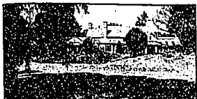
CITY OF BLOOMFIELD HILLS. Exquisite first offering. Located on 1.39 acres with island and two waterfalls. First floor master suite, five other bedrooms, five end one half baths, family room, library, heated conservatory. $2,350,000 (EC-H-50LCV) 741442 Call 646-1400