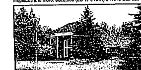
BEAUTIFUL COLONIAL CLARKSTON HOME on a private wooded lot. Spectacular Estate is over 5,000 sq. ft. of luxury! 2 story ceilings, 4 hand carved fireplaces, coffered ceilings, Wainscot trim & crown moldings. Cherry paneled library. Gourmet kitchen, master suite with additional lot. $799,900 (ED-W-08ELK) 739279 Call 626-4000