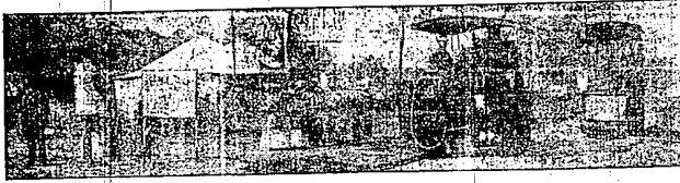
Building Goods Roads at the Michigan State Fair. This Work is done under the Direction of Experts and is a Great Educational Feature.

When and Where to spend a dollar and get full value for it is a problem that confronts every individual seeking a day or a week of recreation. Interests You Don't Hit? Well then here is a suggestion you can profit by.