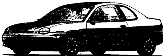
1998 Plymouth Neon

for up to 60 mos. with up to $2,700 * in finance savings