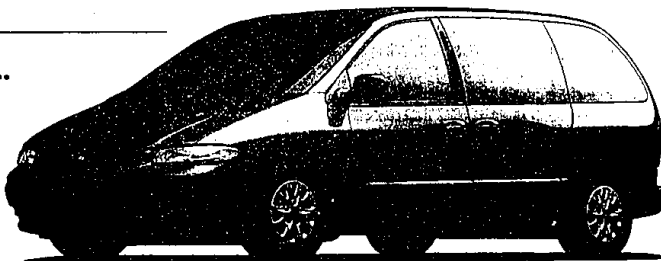
1998 Plymouth Voyager