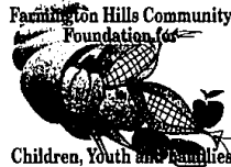
Children, Youth and Families

The community's first youth center opened at the William Costick Activities Center in March 1996. Others centers have since opened at the Farmington Hills Ice Arena, the Farmington Family YMCA and Warner Middle School. The foundation hopes to have centers located throughout the