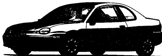
1998 Plymouth Neon

for up to 60 mos. 3 with up to $2,700 4 in finance savings