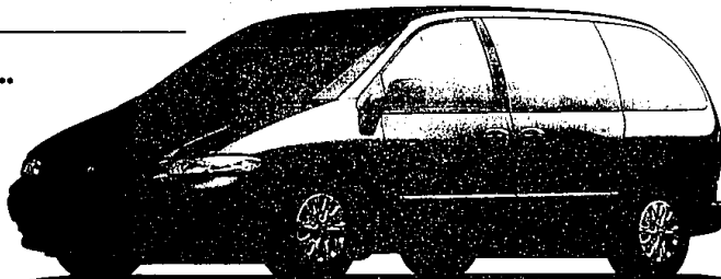
1998 Plymouth Voyager