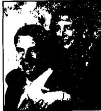
A December wedding is planned at St. Regis Catholic Church in Bloomfield Hills.