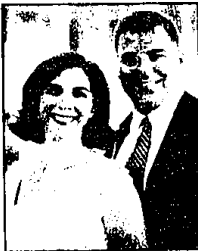
honeymooned at Jackson Hole, Wyo., and they are making their home in Traverse City.