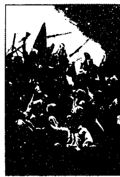
Arise: Students and workers throw up the barricades in Paris during the climactic second act of "Les Miserables."