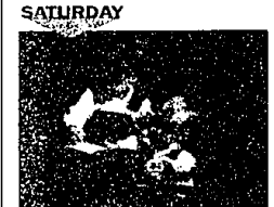
SATURDAY Catch the holiday spirit at Greenberg's Great Train, Dollhouse & Toy Show, 11 a.m. to 5 p.m. at the Novi Expo Center.