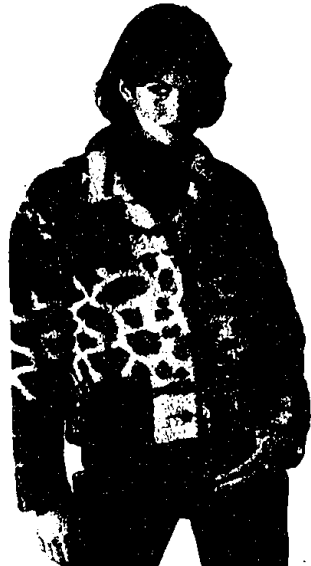
Wild side. Animal print plush jacket from Supply and Demand. Viscose rayon. Made in the USA. Black/white or chocolate/black. Sizes S, M, L. $124 Signature Sportswear