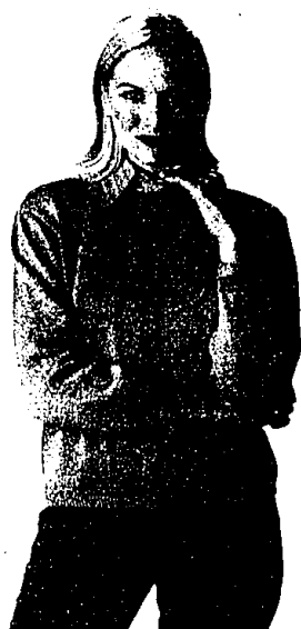
Bright colors. cotton crewneck pullover by Foxcroft. Imported. Lime, yellow, fuchsia, orange, turquoise or white. Sizes S-XL. $52. Sportswear