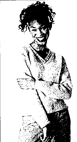
Easy fit. Bouclé V-neck sweater. Cotton/polyester. Imported. Willow green, winter white or ice blue. Sizes S, M, L. $49. Ms. J