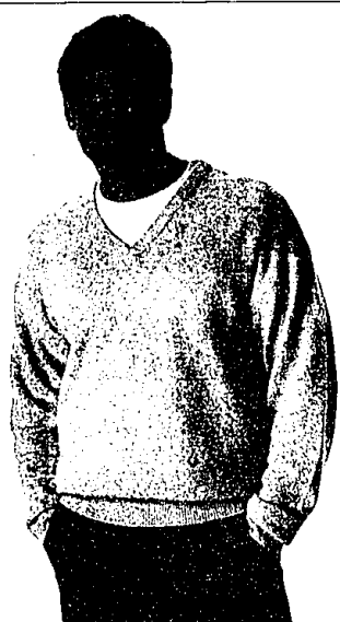
Soft cashmere V-neck sweater. Red, flannel gray, oatmeal, navy, burgundy, black. Imported. Sizes M, L, XL. Reg. $200, now $149. Men's Sportswear