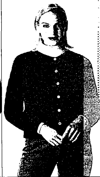
Jacobson's own. Cable cardigan sweater. Cotton. Made in the USA. Red, cement, ivory or black. Sizes S-XL. $78. Sportswear