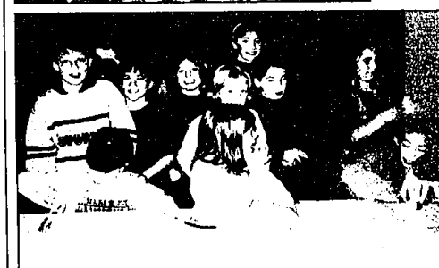
Fill 'em up: Members of the Kenbrook Elementary School student council spent two days in early December filling customers' poinsettia orders.