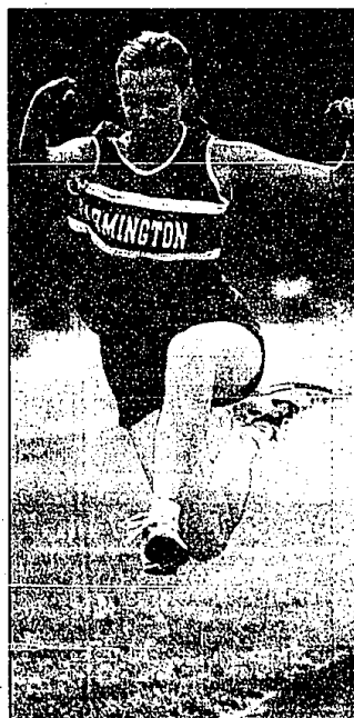
Returning athlete: Kristy Figel returns to compete in jumping events for the Falcons.