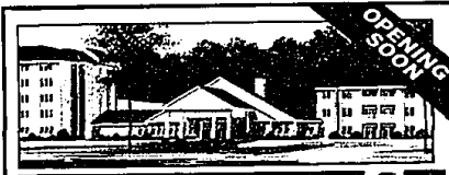
The Elegant Retirement Community in Plymouth

For entry forms, squad times or more information, call (313) 946-9092.